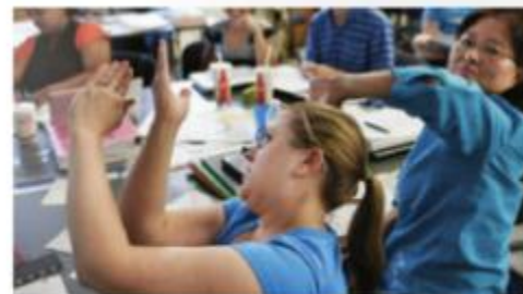
LA-SiGMA program objectives include educating the next generation of highly skilled materials

implementation on present and next generation supercomputers, and educating the next generation of a highly skilled workforce of materials scientists and engineers. The group has made significant progress toward these objectives. In fact, during the summer of 2011, LA-SiGMA and CCT hosted more than 20 undergraduate and high school students at LSU in a Research Experience for Undergraduates, or REU, program, offering the opportunity for a cutting-edge research experience with LSU faculty.